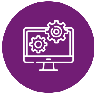
PRODUCT APPROVAL PROCESS

Cirencester Friendly has an approved Product Oversight and Governance Policy, which has been implemented within the Society in accordance with the FCA's rules and guidance. The following are in place to ensure compliance with this policy: