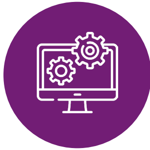
PRODUCT APPROVAL PROCESS

Cirencester Friendly has an approved Product Oversight and Governance Policy, which has been implemented within the Society in accordance with the FCA's rules and guidance. The following are in place to ensure compliance with this policy: